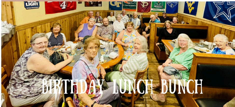
BIRTHDAY LUNCH BUNCH

We have been working on developing a church app to help strengthen our connection as a community of Faith for months. Please download it, mess around with it, and give us some feedback about what you like, what you might not like, and if you think it's missing something. You'll be able to access/edit your contact information, upload your photo, connect with other people, watch our livestream, see your giving, register for events and so much more! Thank you, in advance for helping us build and strengthen our connection to one another!